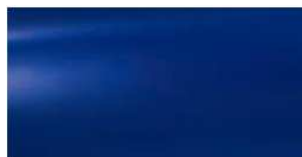
Clipper Blue (Special Point)