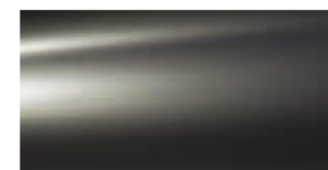
Shark Grey (Metallic)