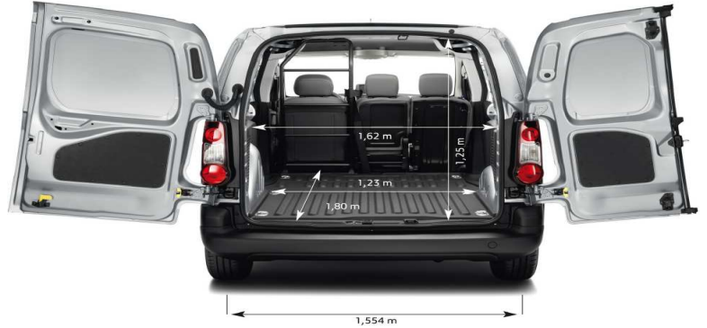
L1 Panel Van