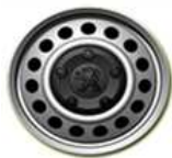
17 inch steel wheel with black centre cap