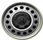
16 inch steel wheel with black centre cap