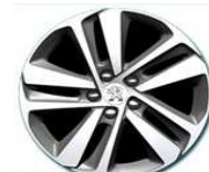
17 inch two tone 'Phoenix' alloy wheel Option on Professional Plus