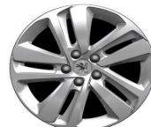
17 inch 'Phoenix' alloy wheel Standard on Professional Plus