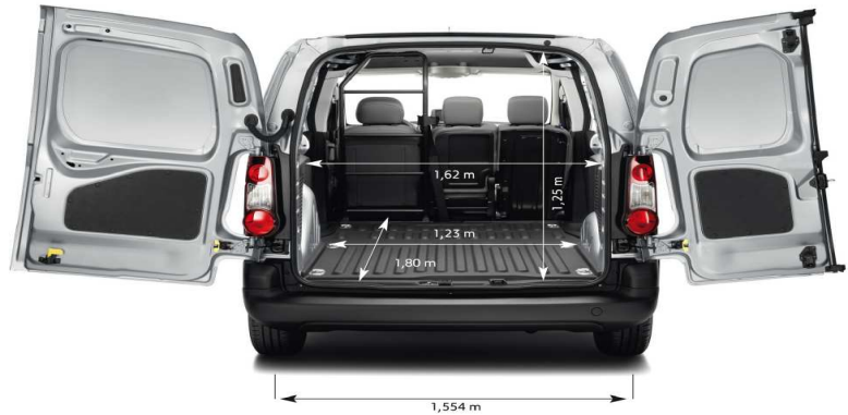
L1 Panel Van